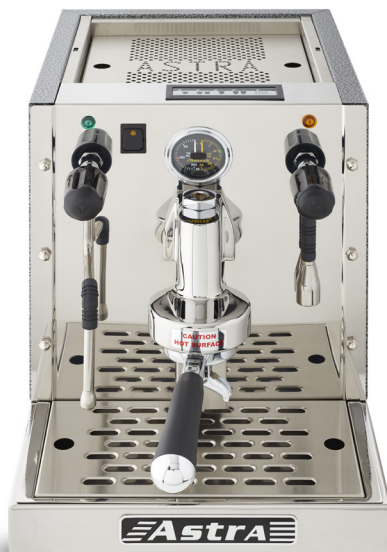
Gourmet Automatic GA021

Creating the perfect blend of artistry and consistency, Astra's automatic range provides portion control with the touch of a button. Designed for high output with the addition of a self-tamping, high-density group head, nickel plated copper boiler and a temperature stabilizing thermocycling system.