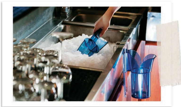
Image: Hastily grabbing a glass to scoop ice at the bar doesn't always give your customers a good first impression. With the demand for a more sanitary and clean kitchen environment, it is vital to be clean not only when preparing food but when serving ice cold drinks as well. Customers expect to see you handling their food products with care and using the Saf-T-Ice System can ensure that clean image.

FACT: FIRST IMPRESSIONS CAN MAKE OR BREAK CUSTOMER EXPERIENCES.