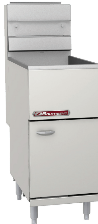
Model shown SB35S