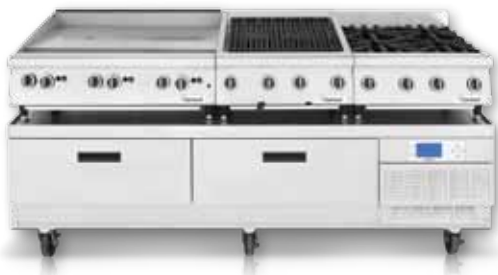
Heavy Duty Counter Series