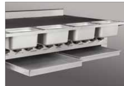
Easy to clean and maintain with removable drip trays

Grill sections are modular to allow for easy removal and handling. Large capacity drip trays slide out for easy cleaning and maintenance.