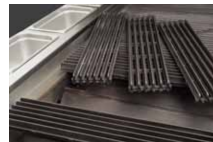
Easy to handle cast iron grates remove in sections

The robust grill and radiant plates are made from durable cast iron. Beneath the burners, stainless steel deflectors help with heat efficiency and reduce flare up. Solid stainless steel exterior and commercial grade components throughout ensure a robust, durable product built to last.