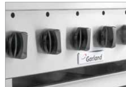
High-Low controls for each section for the perfect set-up

Convenient High low valves allow you to configure your broiler perfectly for your menu. Once set, no adjustment is necessary. Simply use the Quick Switch to start the unit. Training is kept to a minimum.