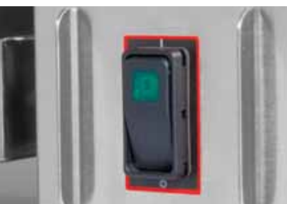
A simple flip of the Quick-Switch is all it takes to fire the unit up