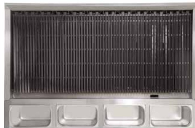
Even cooking temperatures across entire cooking broiler surface

There are no pilot lights in the new Garland HE Broiler. Instead, an electronic sparking mechanism is used to fire up the burners. Should gas flow be interrupted or the flame extinguish for any reason, the spark sequence automatically attempts to re-fire the broiler allowing for trouble free, continuous operation.