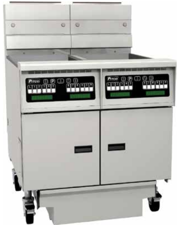
SG14R-2 shown with optional 12 button computer control, filter drawer, & casters

*Available with upgraded controls. Millivolt thermostat standard on Solstice Gas Fryers.