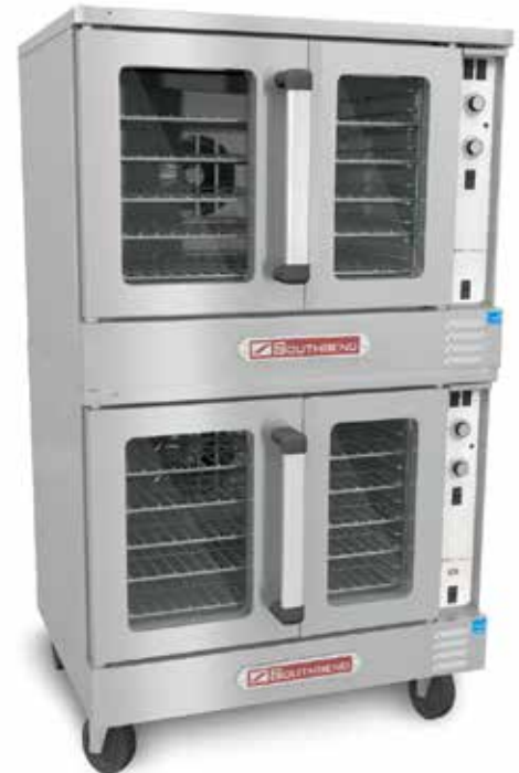
(BES/27SC shown with optional casters)