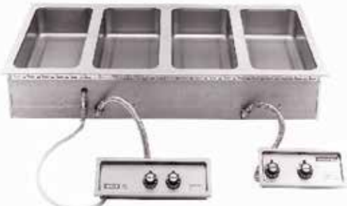
MOD400TDMAF with dual control panels