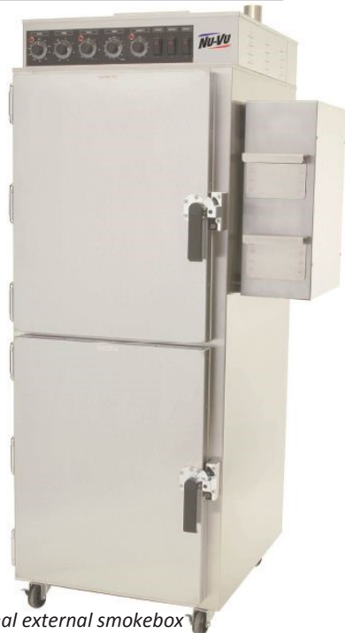
Shown with optional external smokebox