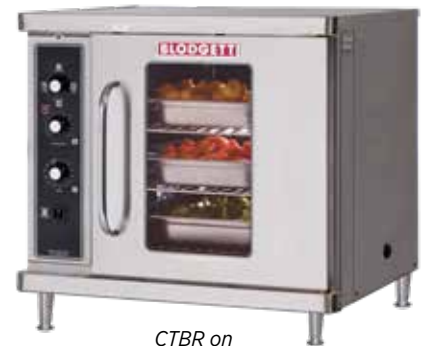
CTBR on standard 4" legs

ES ovens reduce your carbon footprint by 2,544 lbs of CO 2 per year!