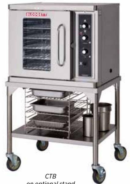
CTB on optional stand