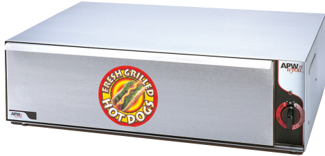
Model BW50 (shown)

APW Wyott bun warmers provide gentle warmth for hot dog buns, keeping them an ideal temperature and texture. A slide-out drawer makes access easy for customers and clerks. Infinite controls are easy to use and set the optimal temperature.