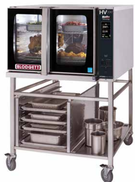
Shown on optional stand with casters