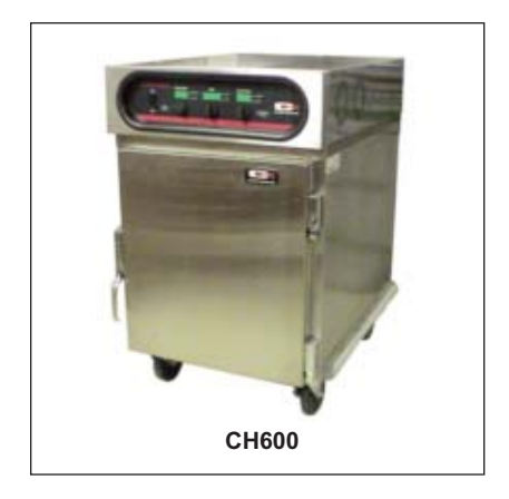
MEAT PROBE INCLUDED!

EASY-TO-USE DIGITAL CONTROLS... Control cooking and holding with separate dial controls and digital display. Cook according to time or according to product temperature with meat probe. Temperature range of 100°F to 200°F for hold cycle and 100°F to 325°F for cook cycle. Eighteen hour timer counts down in cook cycle. When cook cycle is over, cabinet automatically switches to hold cycle and timer counts up.