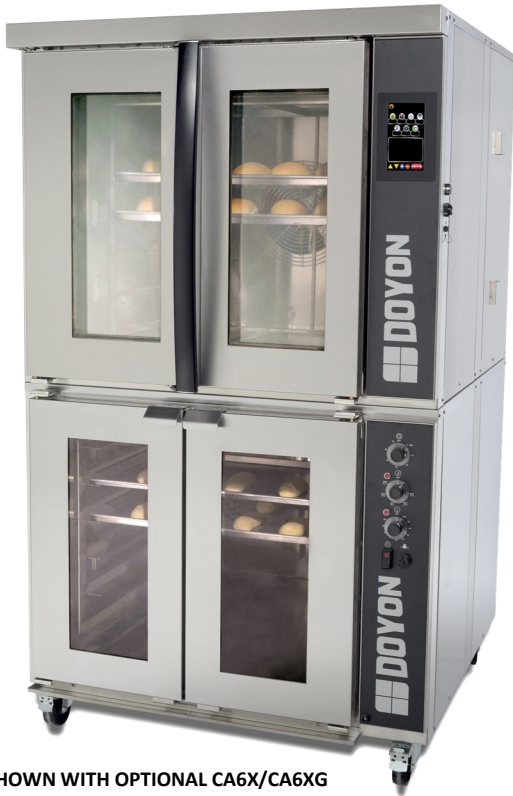
SHOWN WITH OPTIONAL CA6X/CA6XG