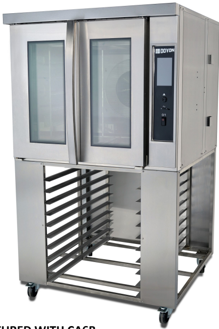
*PICTURED WITH CA6B