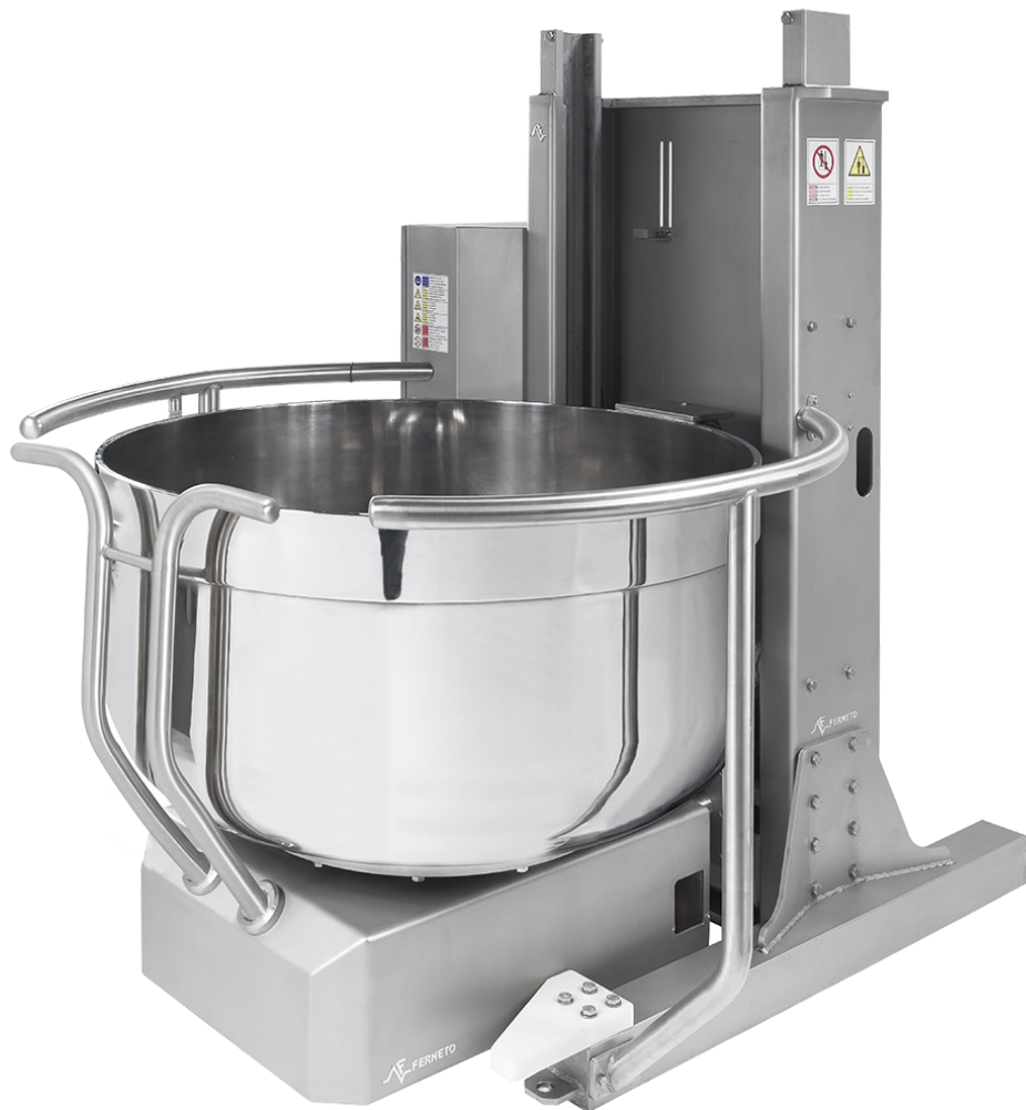
ETE Series Spiral Mixer Bowl Lift, Hydraulic, Floor Mount, 882 Lbs. Maximum Capacity, Electrically Powered, Adjustable Lift Heights, Stainless Steel Construction, 2 Hydraulic Motors