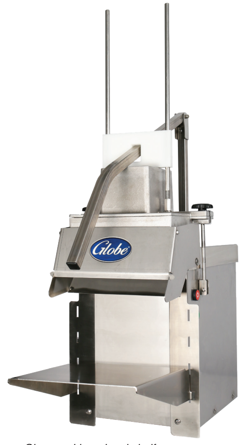
Shown with optional shelf

Shred through up to 6 pounds of cheese in as little as 6 seconds with Globe's new Cheese Shredder!