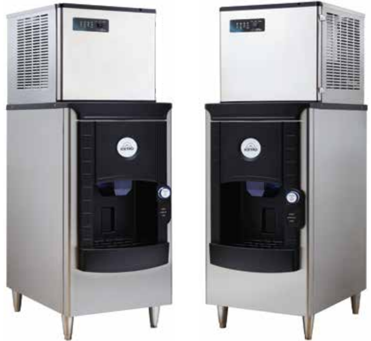
ID-H150-22 shown with IM-0550-AH-22 (Ice machine sold separately)