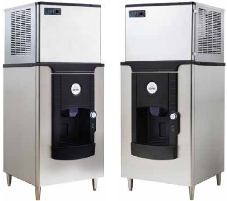
ID-H250-30 shown with IM-0550-AH (Ice machine sold separately)