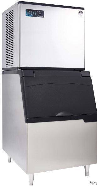
ICETRO IM-0350 ice machine on a IB-033 bin