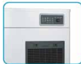
Easy to check and control by the front display