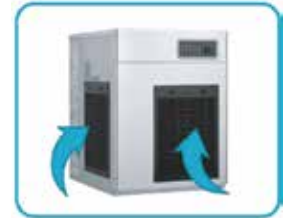
Front & Left In / Rear Out Air Flow