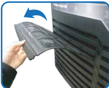
Remove the air filter by sliding forward

Built in Carbon Block Water Filter (One unit is included when you buy a new machine)