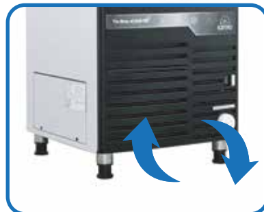
Air ventilation (located in the front in/out) for optimal air flow to produce ice