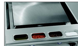
PLANCHA TOP SHOWN WITH OPTIONAL CUT-OUTS FOR FOOD PANS.