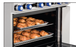
ACCOMMODATE SHEET PANS FRONT-TO-BACK AND SIDE-TO-SIDE.