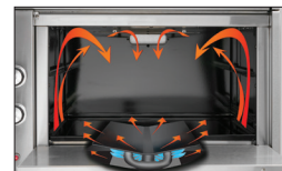
"M" SHAPED BURNER FOR EVEN HEATING THROUGH-OUT THE OVEN CAVITY.