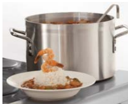
Large 5" (127 mm) stainless steel landing ledge for convenient plating.