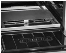
Splatter screen protects the element from spills.