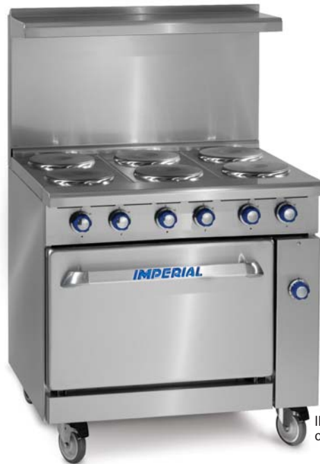
IR-6-E shown with optional casters