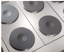
9" (229 mm) sealed round plate elements with easy to clean flat surface.