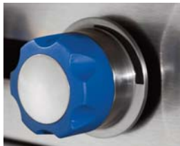
Durable cast aluminum with a vylox heat protection grip.