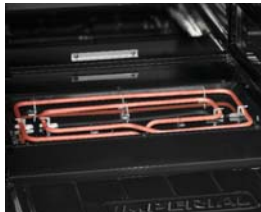
5 KW element provides even heating throughout the oven cavity.