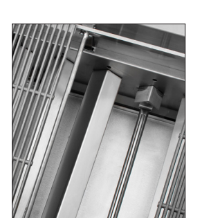
STAINLESS STEEL BURNERS W/CAST IRON RADIANTS.