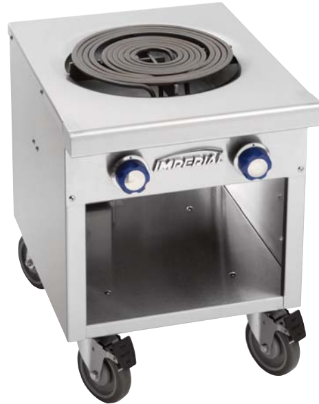
ISPA-18-E shown with optional casters