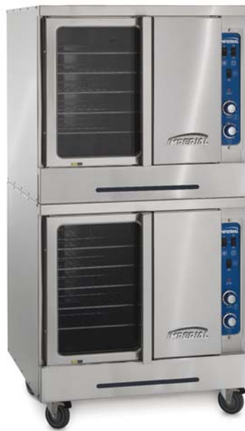
ICVE-2 shown with optional casters

Four bearings per door extend the life of the door mechanism.