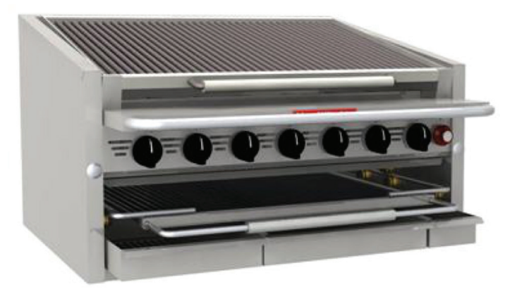
Unit shown with optional lower rack