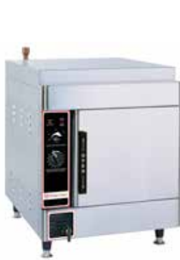
Altair II - 4