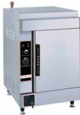
Altair II - 6