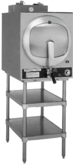
Shown on optional stand with extra shelf

ST-E (Three pan electric pressure cooker)