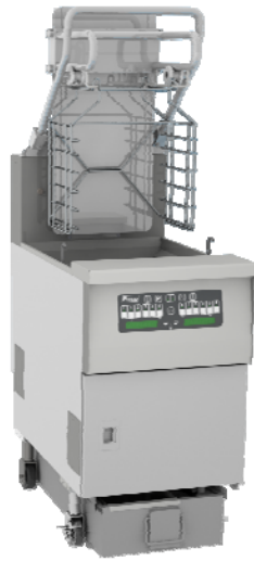
SGLVRF Shown with K12 computer, 9" front / rear casters