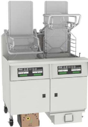
SGLVRF DUAL Shown with K12 computer, 9" front / rear casters