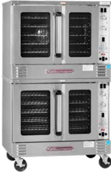
BGS/23SC shown with optional casters