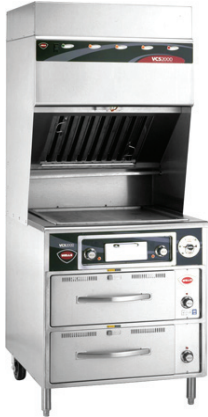
Model WV2HGRW SHOWN