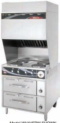
Model WV4HFRW SHOWN