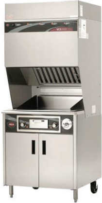
Model WVG136 SHOWN