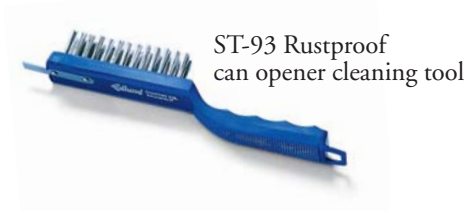
ST-93 Rustproof can opener cleaning tool