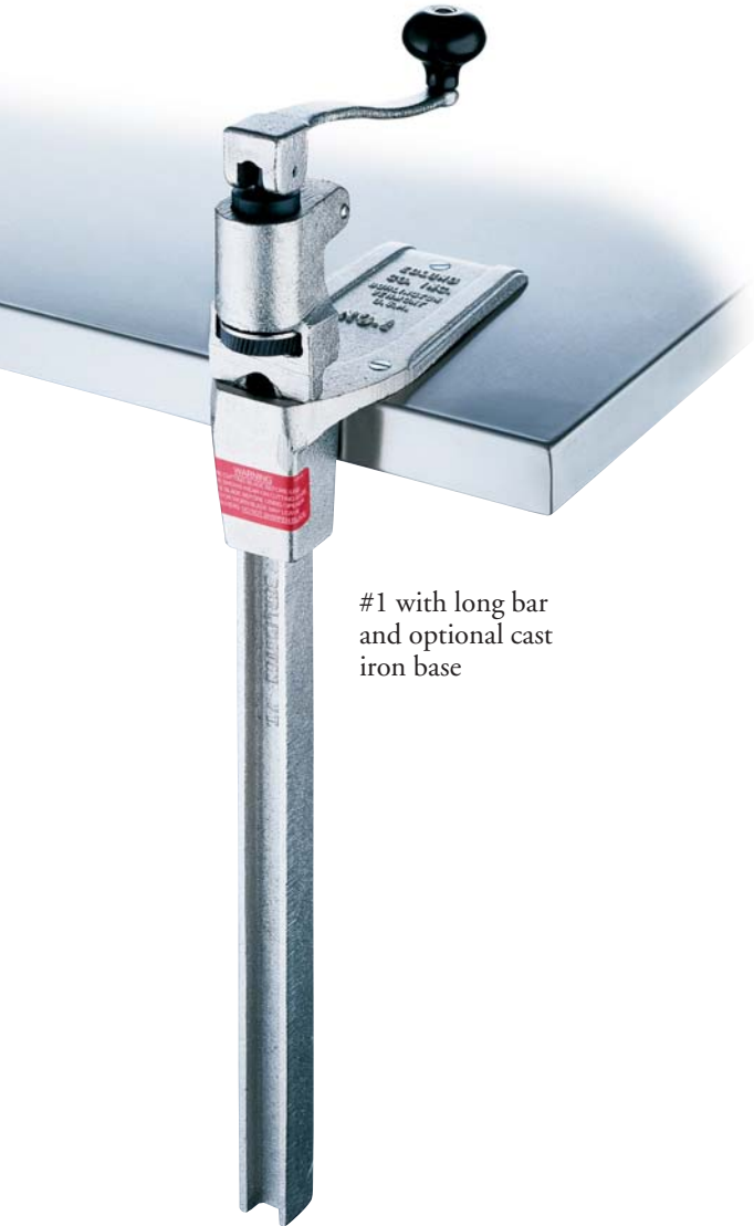
#1 with long bar and optional cast iron base