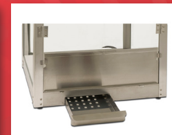
Old Maid Drawer