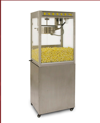
Silver Screen 14 with Optional Pedestal Base

The Silver Screen Professional Popcorn Machines are our most technically advanced models. These models incorporate a separate cabinet thermostat and temperature indicator. This Benchmark USA innovation allows you to accurately control the heat in the food zone ensuring that your popcorn is always at the perfect serving temperature. Each Silver Screen model has a stainless steel cabinet and food zone insuring years of durability. The Silver Screen Poppers utilize a hard-coat anodized, high Thermal Mass Kettle for easy cleaning and superior performance. The four-switch configuration allows for any operating situation. They are available in a space saving 8 ounce model and a high production 14 ounce model. Either model will work on a standard 15 amp circuit so that it can be used anywhere without any additional electrical wiring. Optional stainless steel pedestal bases with heavy-duty casters and storage capabilities are available for either model.