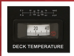
Cabinet Temp Indicator