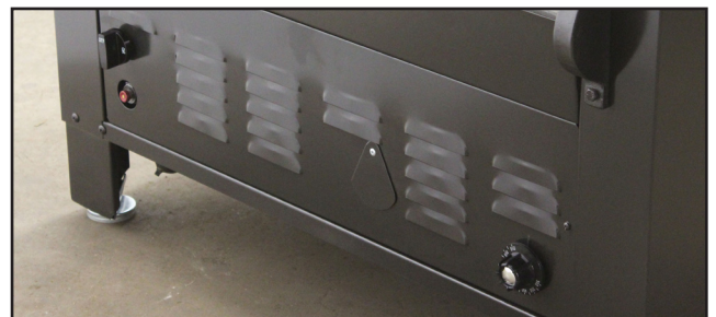
Easy access front controls