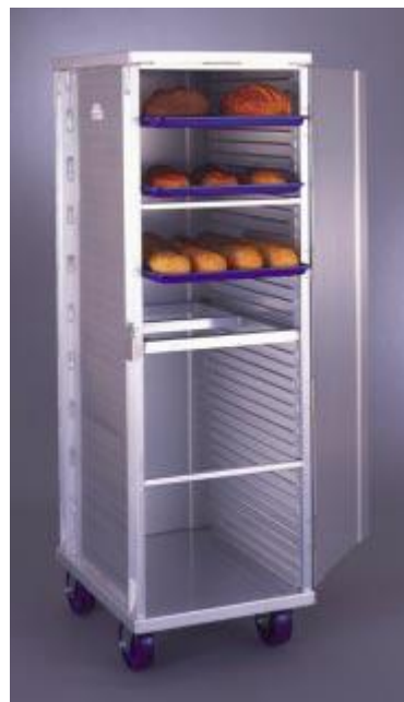
#1290PP • #1290WDW • #1292 Enclosed Pan Rack

All units carry a Lifetime Guarantee against rust and corrosion as well as a Five-Year Guarantee against material defects and workmanship.