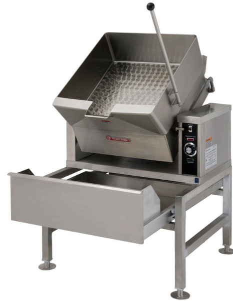
Shown with optional stand and faucet