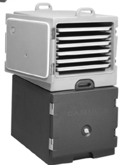
1826MTC (For Trays and Sheet Pans)