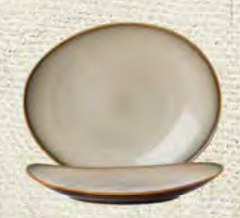
Oval Coupe Plate L675DEC#324 (7½"), 3 Doz. L675DEC#342 (9"), 2 Doz. L675DEC#358 (11½"), 1 Doz.