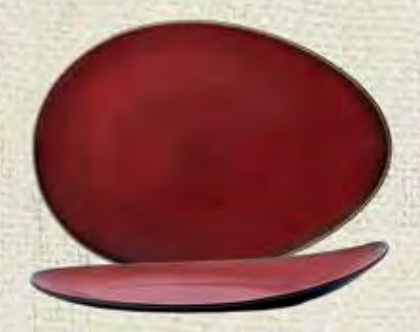
Eclipse Plate L675DEC#385 (14"), 1 Doz.