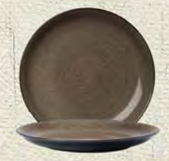
Round Coupe Plate L675DEC#119 (6½"), 2 Doz. L675DEC#123 (7"), 3 Doz. L675DEC#133 (8½"), 2 Doz. L675DEC#151 (10½"), 1 Doz. L675DEC#163 (12½"), 1 Doz.