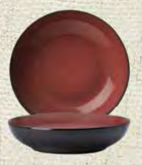
Round Deep Coupe Plate L675DEC#123C (7"), 3 Doz. L675DEC#133C (81/4"), 2 Doz.