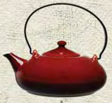
Teapot w/ Metal Handle L675DEC#861 (61/4"), 14 oz., 1 Doz.