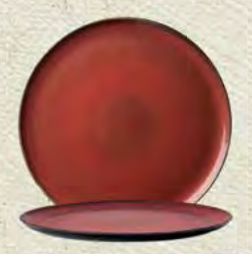
Pizza Plate L675DEC#898 (12½"), 1 Doz.