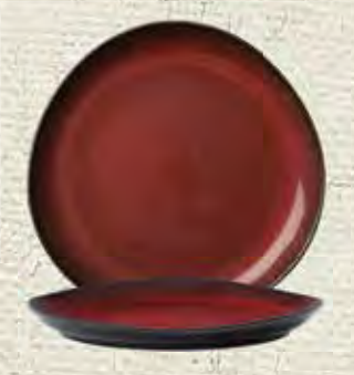
Plate L675DEC#123P (7"), 3 Doz. L675DEC#124P (7¼"), 2 Doz. L675DEC#157P (11¼"), 1 Doz.

Limited 5 year or 5,000 washes glaze warranty