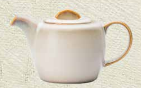
Teapot L675DEC#860 (7"), 14 oz., 1 Doz.