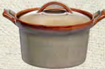
Casserole L675DEC#676 (6½"), 16 oz., 1 Doz.