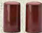
Salt Shaker L675DEC#910 (1½"), 6 Doz. Pepper Shaker L675DEC#911 (1½"), 6 Doz.