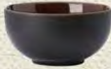
Bowl L675DEC#950 (4¼"), 9 oz., 4 Doz. L675DEC#951 (5"), 15 oz., 4 Doz. L675DEC#952 (5¾"), 22 oz., 2 Doz.