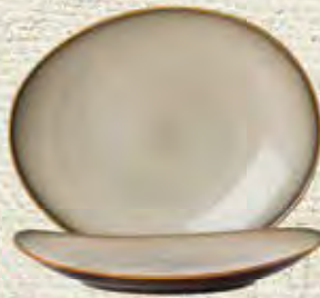
Oval Coupe Plate L675DEC#324 (7¼"), 3 Doz. L675DEC#342 (9"), 2 Doz. L675DEC#358 (11½"), 1 Doz.