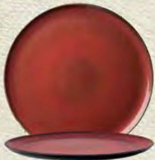
Pizza Plate L675DEC#898 (12½"), 1 Doz.