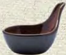
Small Tapas Spoon / Dish L675DEC#943 (3"), 2 oz., 6 Doz.