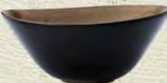
Soup Bowl L675DEC#760 (4½"), 8 oz., 4 Doz. L675DEC#762 (6"), 14 oz., 3 Doz. L675DEC#763 (7½"), 24 oz., 2 Doz. L675DEC#764 (9"), 42 oz., 1 Doz.