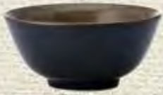
Bowl L675DEC#526 (4½"), 7 oz., 4 Doz.