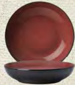
Round Deep Coupe Plate L675DEC#123C (7"), 3 Doz. L675DEC#133C (8¼"), 2 Doz.