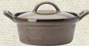
Casserole L675DEC#675 (6¾"), 8 oz., 1 Doz.