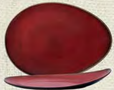
Eclipse Plate L675DEC#385 (14"), 1 Doz.