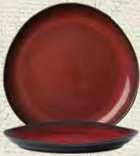
Plate L675DEC#123P (7"), 3 Doz. L675DEC#124P (7¼"), 2 Doz. L675DEC#157P (11¼"), 1 Doz.