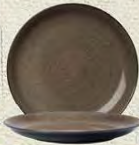
Round Coupe Plate L675DEC#119 (6½"), 2 Doz. L675DEC#123 (7"), 3 Doz. L675DEC#133 (8½"), 2 Doz. L675DEC#151 (10½"), 1 Doz. L675DEC#163 (12¼"), 1 Doz.