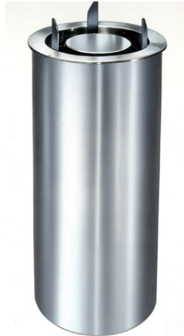
Model 92325 Shielded