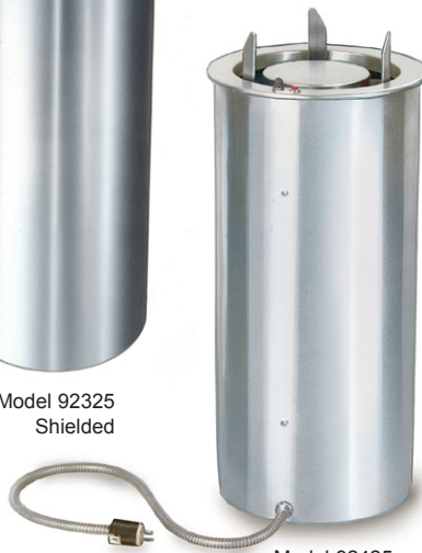
Model 92425 Heated