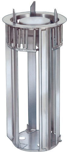
Model 92225 Open

90225, 91225, 92225, 93225, 194225 90325, 91325, 92325, 93325, 193225 91425, 92425, 93425, 194425