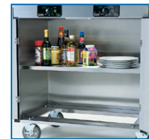
Interior Storage Shelf