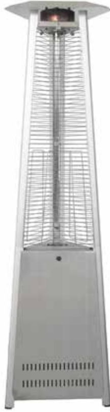
2233-01 Stainless Steel