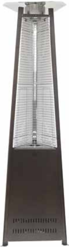
2222-01 Hammered Bronze