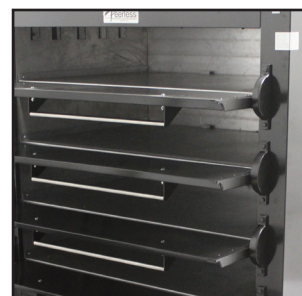
Adjustable Dampers at each deck