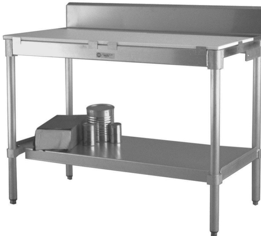
Poly Top Table with Backsplash

These tables carry a Lifetime Guarantee against rust and corrosion and also carry a Five-Year Guarantee against workmanship and material defects.