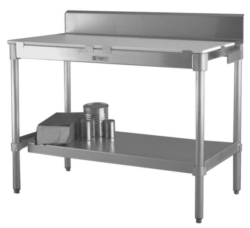
Poly Top Table with Backsplash

These tables carry a Lifetime Guarantee against rust and corrosion and also carry a Five-Year Guarantee against workmanship and material defects.