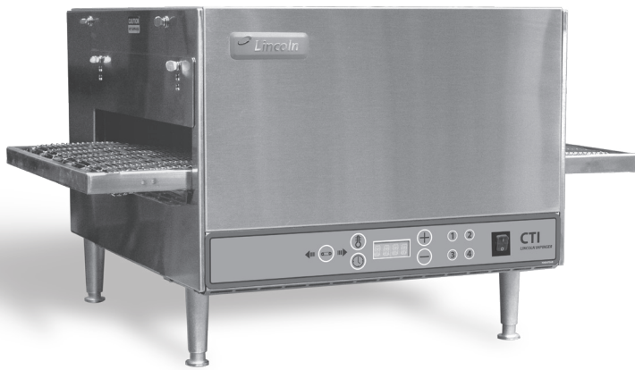
Shown with 31" (787 mm) standard conveyor.